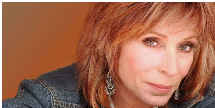
Juice Newton Music