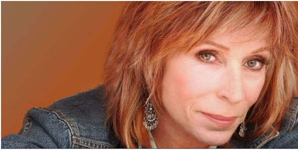
Juice Newton Music