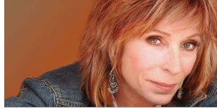
Juice Newton Music juicewtonmusic.com